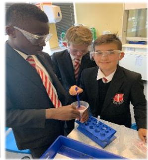
YEAR 7 EXTRACTING DNA FROM STRAWBERRIES