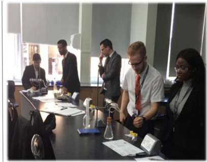
YEAR 12 CHEMISTS INVESTIGATING RATES OF REACTIONS