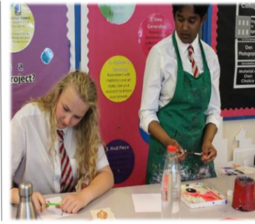
YEAR 10 GCSE ART