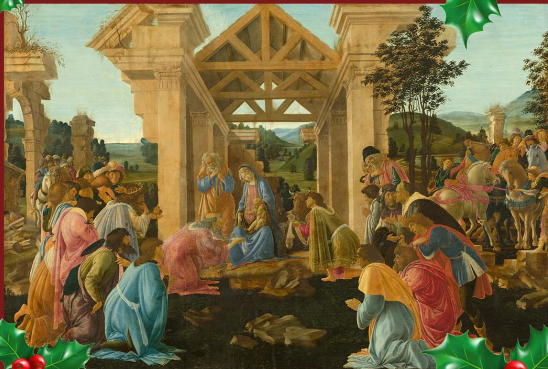
The Adoration of the Magi, c. 1478/1482 Sandro Botticelli

To celebrate the beginning of Advent and look forward to the birth of baby Jesus at Christmas, St. Joseph's Art department would like to invite you all to join us in producing an A4 design for a Christmas Card. Your cards can be as creative and inventive as you wish; glam with glitter or digging with digital, the winning design will be original and creative, reflecting the 'Spirit' of joy and kindness we can all bring to one another at this special time.