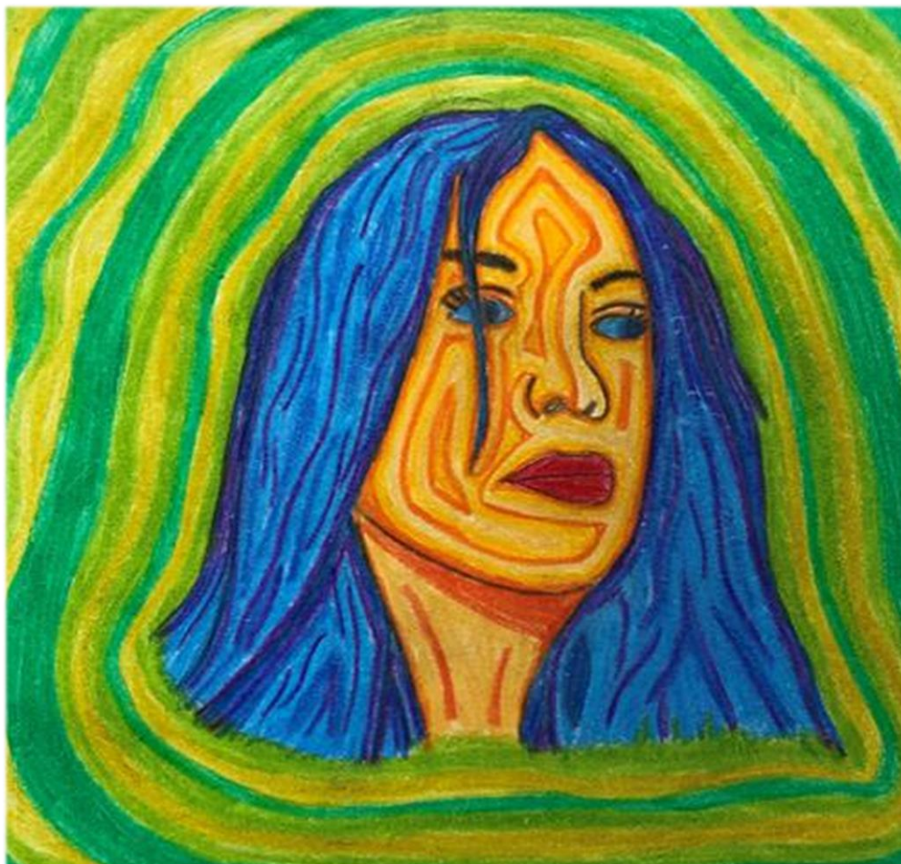
ART WORK BY NIKOLA NIEZGODA – YEAR 9