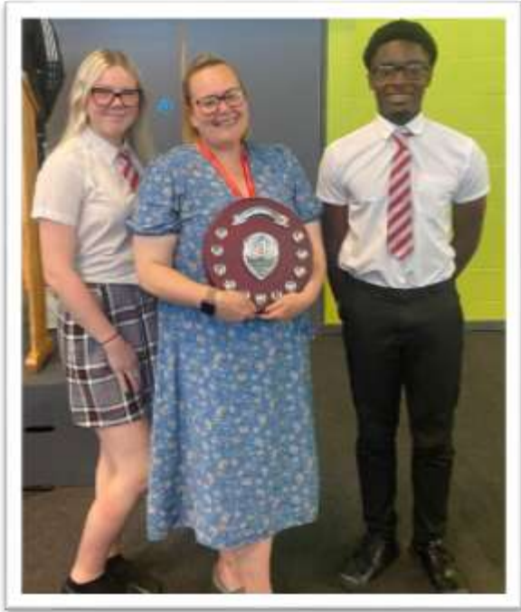
Veronica the House winners of 2024