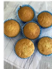
Year 7 last class of cupcakes ☺