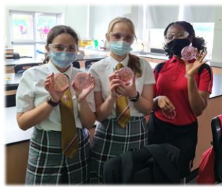
YEAR 9 STUDENTS MADE SOAP IN SCIENCE CLUB THIS WEEK