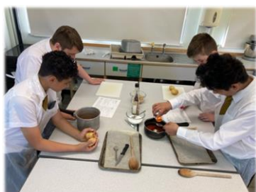
Year 8 making wedges and homemade ketchup.