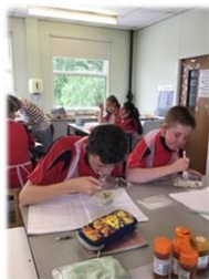
Year 7 preparing and tasting their potato salads.

The week started out SO hot! As the temperatures soared we certainly felt the heat in the food room which was still buzzing with activity in a busy few days which saw Year 7 and Year 8 classes continuing to develop their skills.