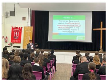
ASSEMBLY ON THE PREVENT AGENDA TODAY