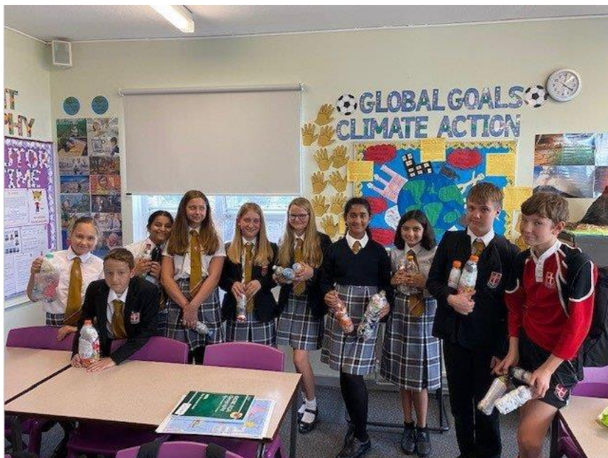
First Geography Club of the Year