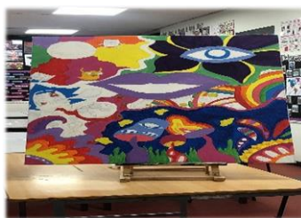
PAINTING IN PROGRESS BY LUCIA MOURATO IN YEAR 12