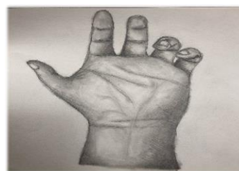
HAND DRAWING BY CHARLENE DAGUPLO IN YEAR 9