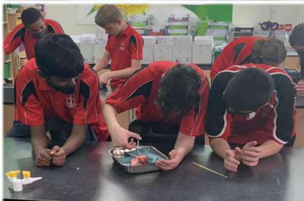
YEAR 9 STUDENTS DISSECTING HEARTS IN SCIENCE