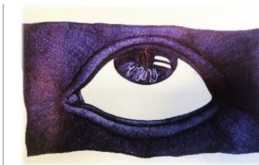
PEN DRAWING BY MIA IN YEAR 12