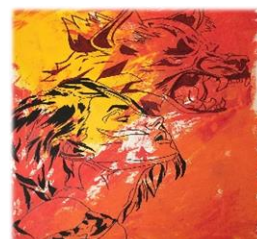
EXPERIMENT WITH ACRYLICS AND LINE DRAWING BY KAROLINA IN YEAR 13