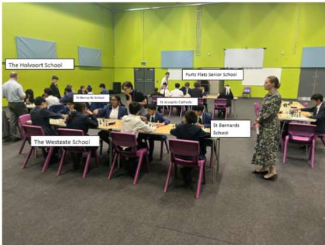
Figure 1: Students from Furtz Platt, St Bernards, St Josephs, Holyport and Westgate High Schools enjoying a game of chess while their Teachers kept scores.

If you wish to represent our school in future tournaments, please join our club and meet us on Fridays after school in M6.