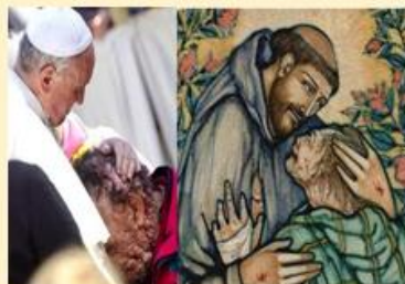
St Francis and Pope Francis embracing lepers

One of the most beloved and venerated saints, St Francis is a model of humility, service and love for every creature.