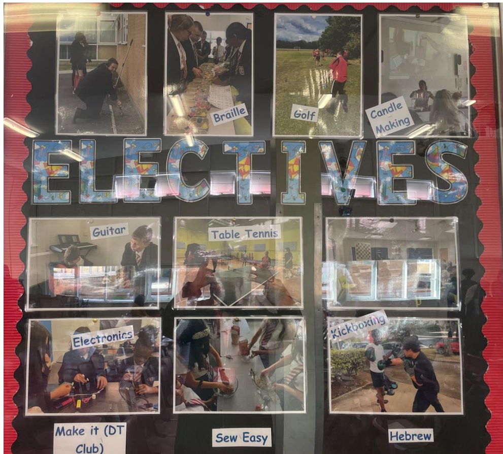
Electives Display in the Main Hall

Every Wednesday Period 5 your child has been taking part in the Electives programme. This is an enrichment session on a broad range of skills and knowledge that each pupil has been elected to take part in. It's been very exciting seeing pupils learn, braille, kick boxing, how to make a remote car, first aid, Psychology, mummification in world history and so much more! It is our first year running the Electives and we hope it grows to be even better.