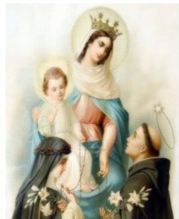
Our Lady of the Rosary, pray for us.

God, we give you thanks for the gift of the Holy Rosary. Through it, may we contemplate and imitate, with Holy Mary, the mysteries of the life of your son, Jesus. Amen.