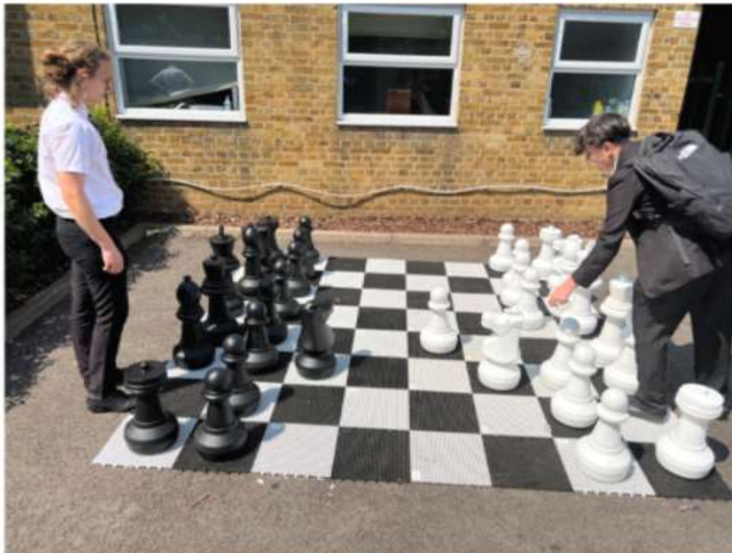
Figure 1: Students enjoying a game of chess while others look on.