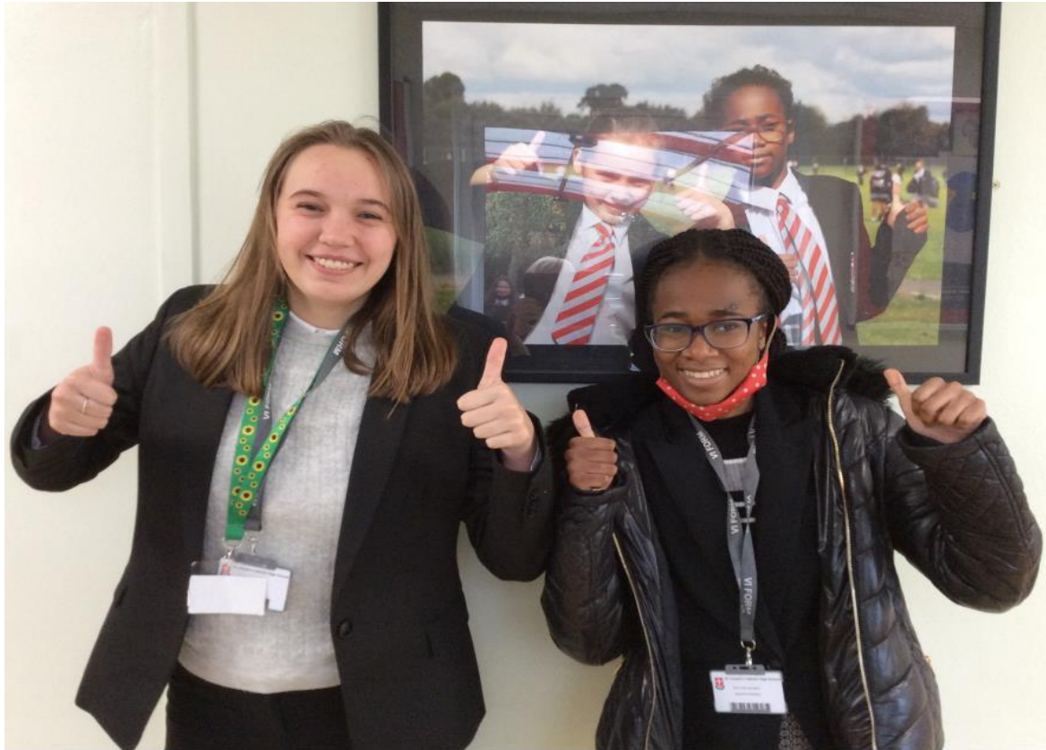
From Year 7 to 6 th Form - Friendships last forever at St Joseph's