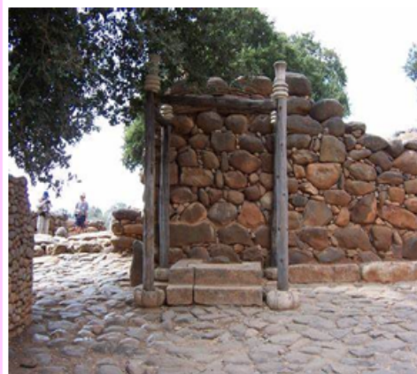
The judgment seat at Tel Dan (800 BC)

Be present, O merciful God, and protect us through the silent hours of this night, so that we, who are wearied by the changes and chances of this fleeting world, may repose upon your eternal changelessness; through Jesus Christ our Lord. Amen.