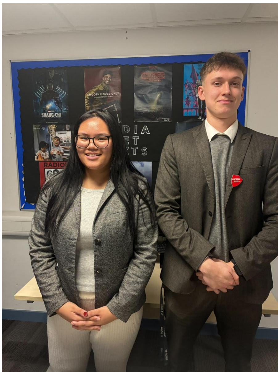
5 - Year 13 Media Leaders