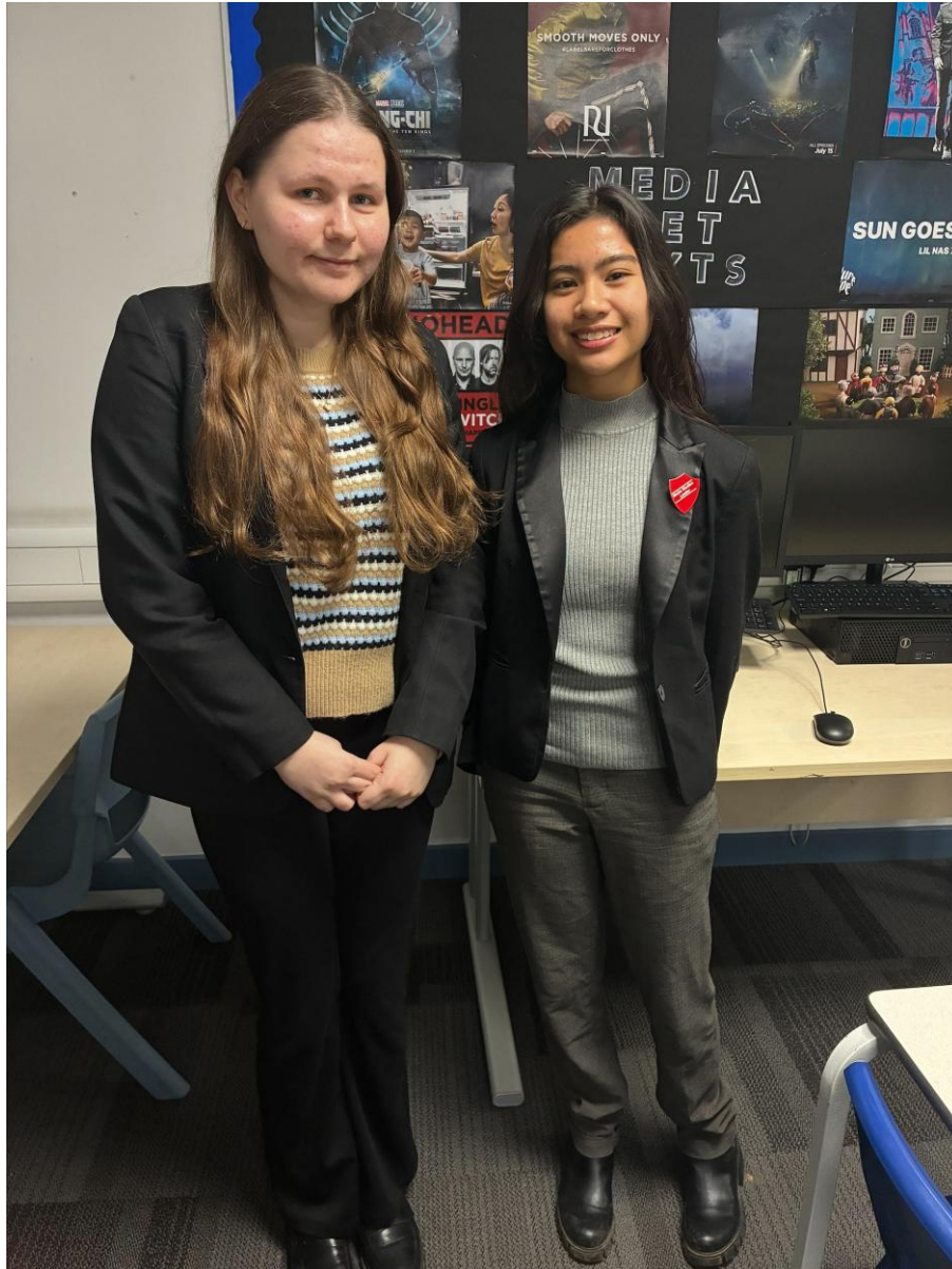
6 - Year 12 Leaders