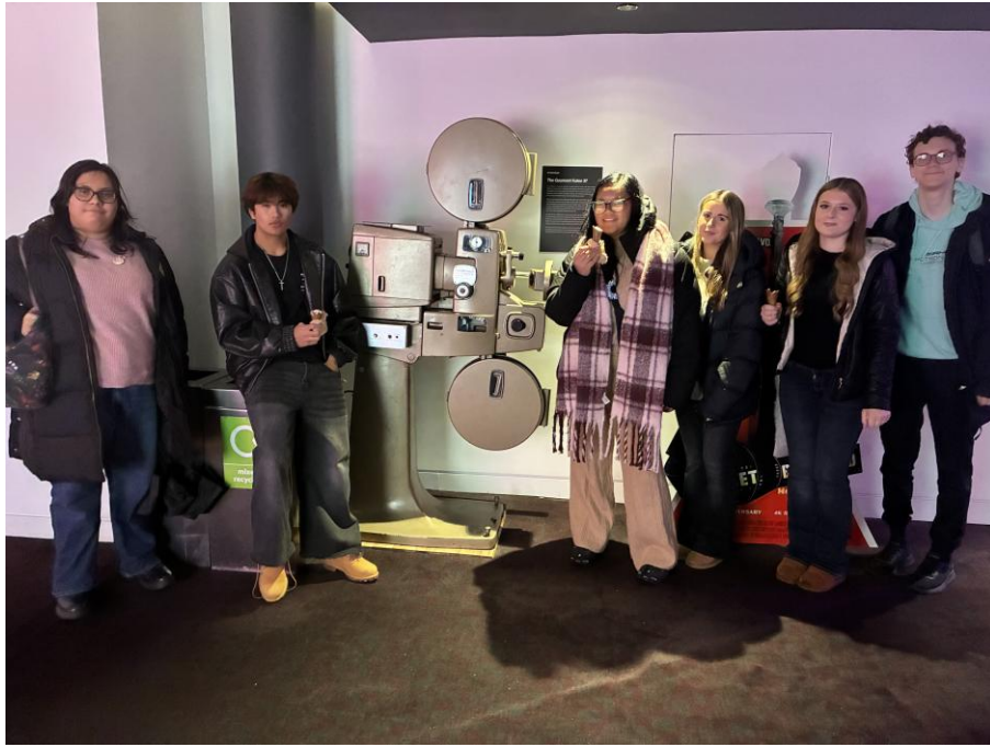
4 - Media Studies A Level trip to the British Film Institute.