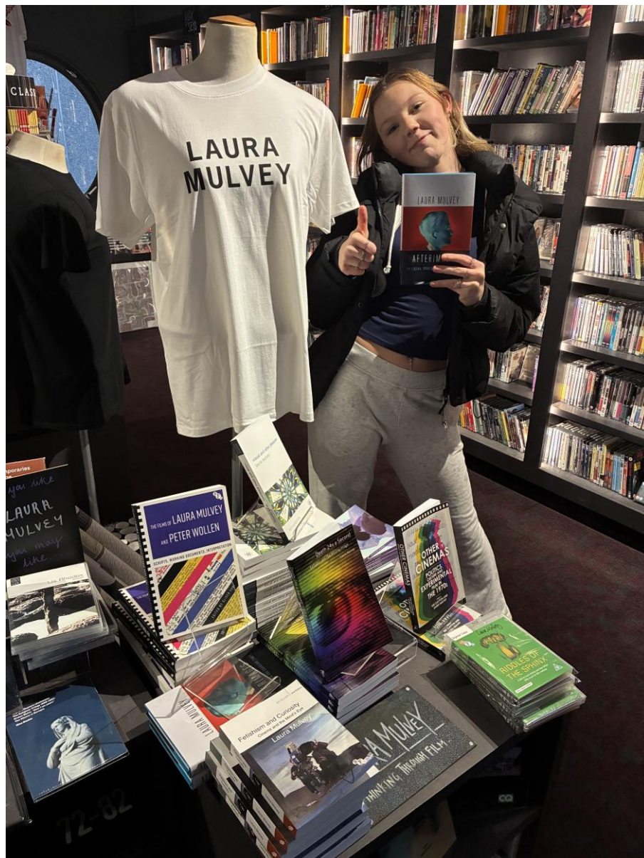
3 - Media Studies A Level trip to the British Film Institute.