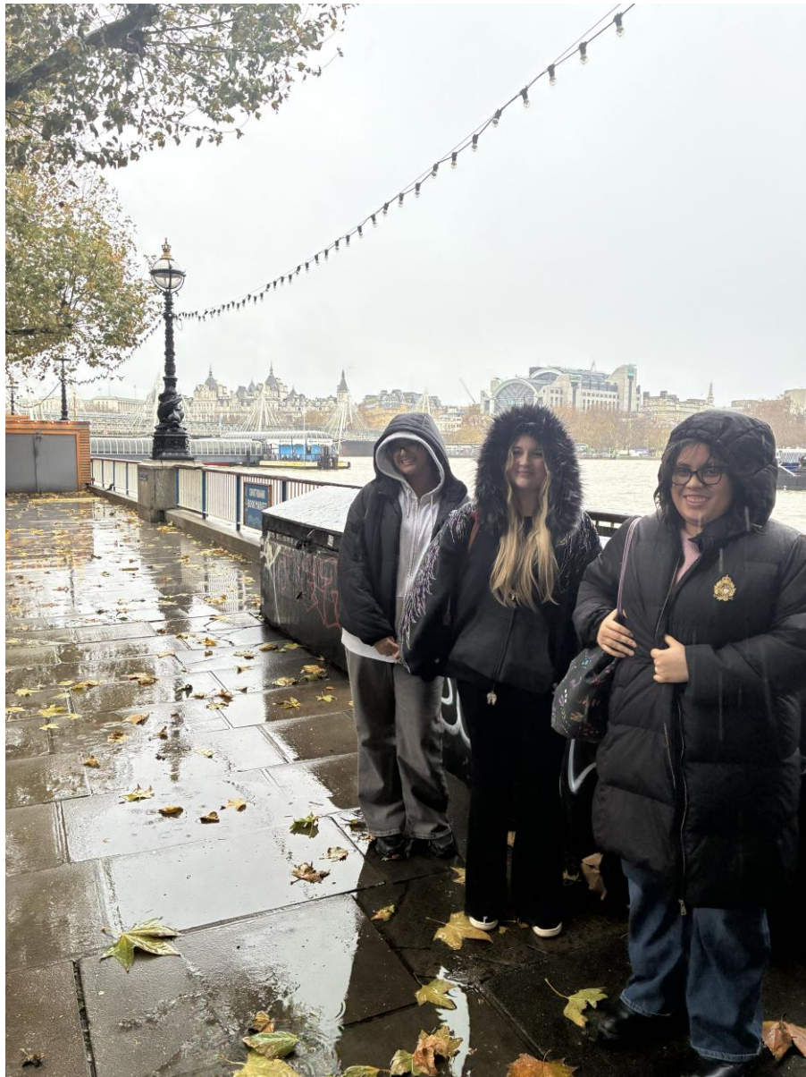
2 - Media Studies A Level trip to the British Film Institute.