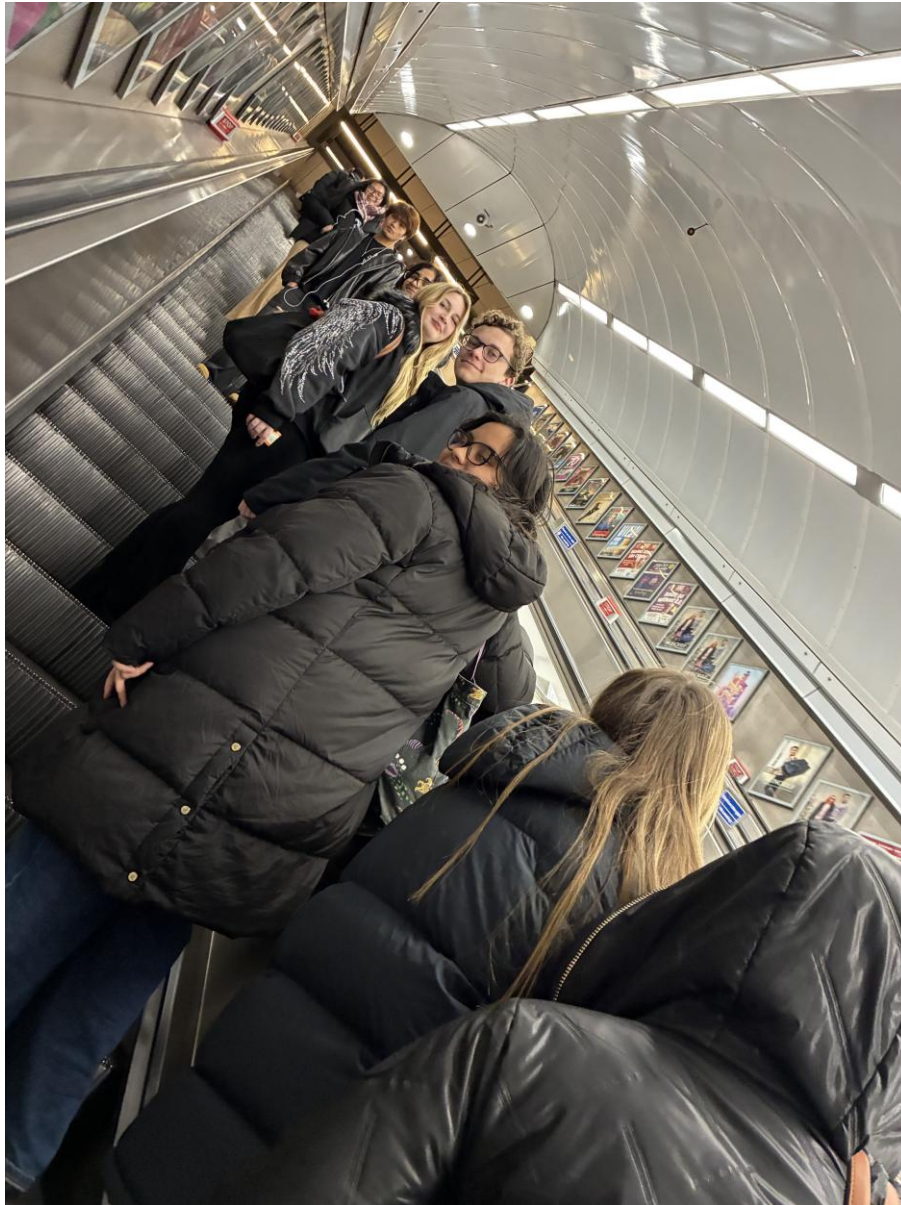
1 - Media Studies A Level trip to the British Film Institute.

The trip provided an enriching learning experience, strengthening students' subject knowledge and offering fresh insights that will support them throughout their Media Studies coursework and exams.