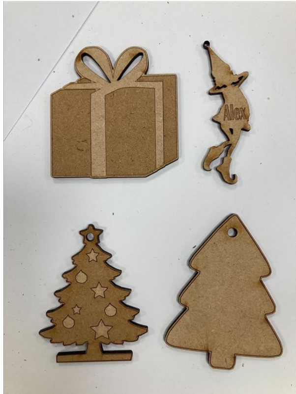
DT Make It Elective