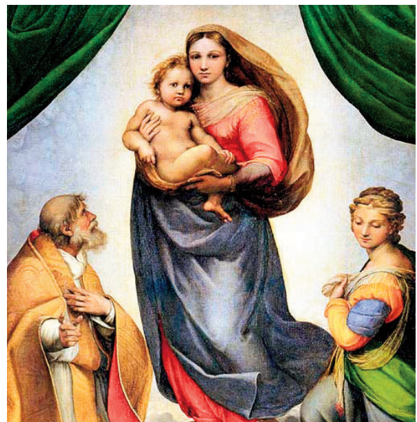
Raphael's Madonna, Sistine Chapel

It's an uplifting and beautiful thought.