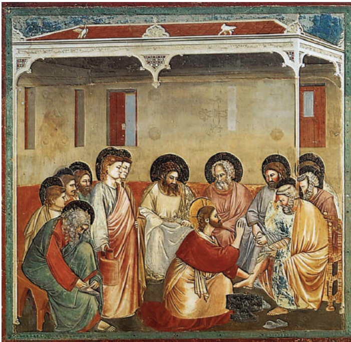
Washing of the Feet, Giotto, Scrovegni Chapel

O God, who in creating the human race willed that man and wife should be one, join, we pray, in a bond of inseparable love these your servants who are to be united in the covenant of Marriage, so that, as you make their love fruitful, they may become, by your grace, witnesses to charity itself.