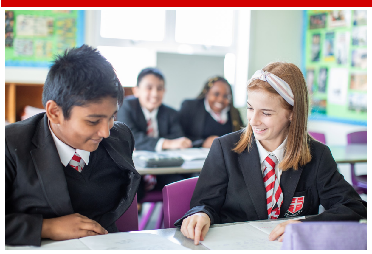
Unlocking Belief in All.