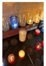
The candle for the school community